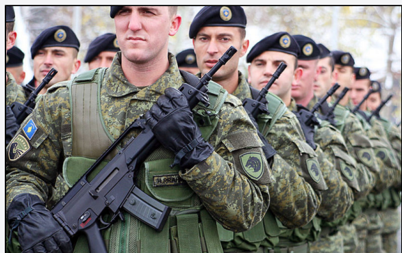
"The creation of Kosovan Army" Dec 2018

The Serb politician Oliver Ivanovic , was killed in January 2018 in northern Kosovo, and that caused a heat between the two countries. After that horrifying incident, the discussions between the states were postponed, because Serbia stated that this was "an act of terrorism." Afterwards, Kosovo raised its tariff duties on the imports from Serbia to 100%. Nevertheless, both presidents, Thaçi and Vucic, will again have a talk on April 29th in a gathering which is being organized by France and Germany and try and find actual solutions to their pause.