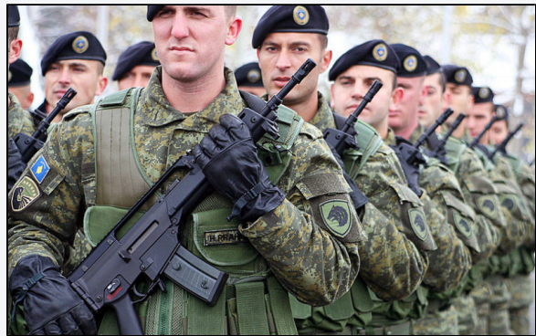
"The creation of Kosovan Army" Dec 2018

The Serb politician Oliver Ivanovic , was killed in January 2018 in northern Kosovo, and that caused a heat between the two countries. After that horrifying incident, the discussions between the states were postponed, because Serbia stated that this was "an act of terrorism." Afterwards, Kosovo raised its tariff duties on the imports from Serbia to 100%. Nevertheless, both presidents, Thaçi and Vucic, will again have a talk on April 29th in a gathering which is being organized by France and Germany and try and find actual solutions to their pause.