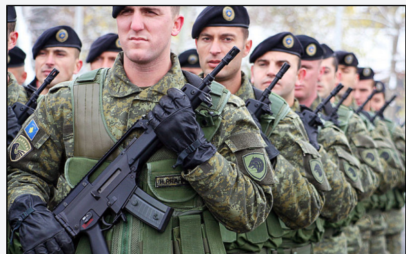
"The creation of Kosovan Army" Dec 2018

The Serb politician Oliver Ivanovic , was killed in January 2018 in northern Kosovo, and that caused a heat between the two countries. After that horrifying incident, the discussions between the states were postponed, because Serbia stated that this was "an act of terrorism." Afterwards, Kosovo raised its tariff duties on the imports from Serbia to 100%. Nevertheless, both presidents, Thaçi and Vucic, will again have a talk on April 29th in a gathering which is being organized by France and Germany and try and find actual solutions to their pause.