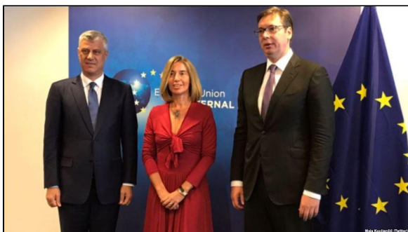
"Confrontation or Normalization?"

Kosovo turned into a self-governed region beneath the United Nations , which was assigned with defining Kosovo's future standing. Kosovo announced its independence in 2008 but Serbia didn't and still doesn't accept Kosovo as an independent country and it is because Serbia considers Kosovo part of its own state. Today, their relations are still at edges with continuous conflicts.