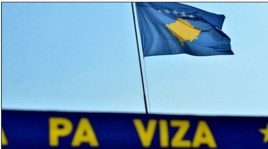
Kosovo's protests for visa liberalization

To this day, visa liberalization for Kosovo still remains a matter in progress. Kosovar citizens continue to hope that visas will be liberalized as soon as possible. There are ongoing protests and concerns about this topic. This would be a big step for Kosovo's pursuit of membership in the EU. Visa liberalization is anticipated to happen within the year (2019).