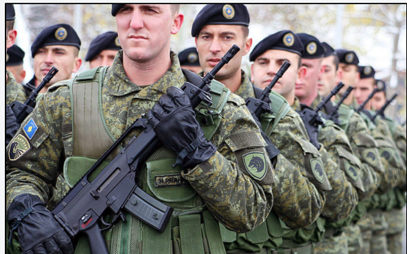
"The creation of Kosovan Army" Dec 2018

The Serb politician Oliver Ivanovic , was killed in January 2018 in northern Kosovo, and that caused a heat between the two countries. After that horrifying incident, the discussions between the states were postponed, because Serbia stated that this was "an act of terrorism." Afterwards, Kosovo raised its tariff duties on the imports from Serbia to 100%. Nevertheless, both presidents, Thaçi and Vucic, will again have a talk on April 29th in a gathering which is being organized by France and Germany and try and find actual solutions to their pause.