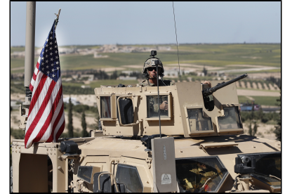
U.S soldiers deployment in Kosovo

The Iowa National Guard -led bilateral state partnership project, launched in 2011, was developed with the long-term goal of developing and expanding relations with the Kosovo Security Force (KSF), which will assist Kosovo in fostering regional security and cooperation and contribute to the US goal of a secure, stable Europe as a whole.