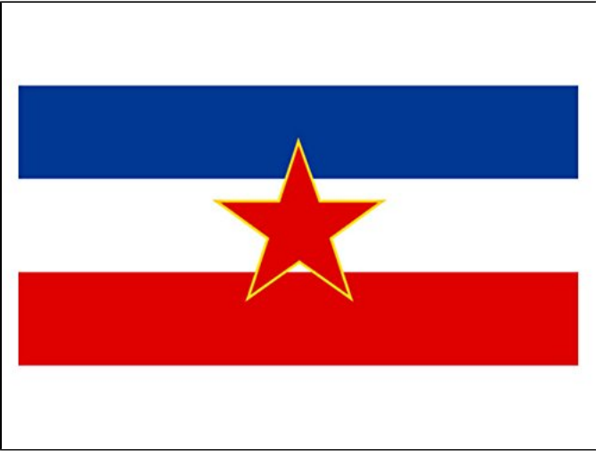
FLAG OF YUGOSLAVIA

Elections were held only with one, without any other candidate, and in the end CNF won the elections in 1945. Peter 2 were remove and then FPRY. Tito on these moments was not with all his powers in command.